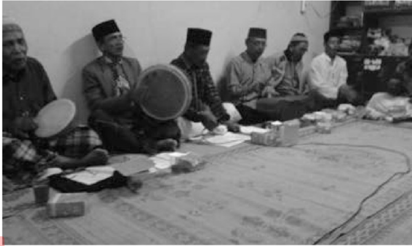
Figure 2. The Group of Larasmadya Art from Durenan, Triharjo, Sleman.