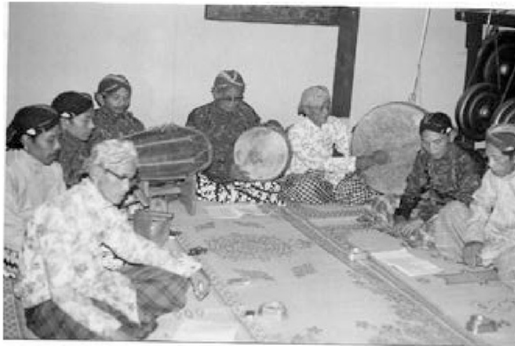
Figure 3. The Group of Larasmadya Art from Temulawak, Triharjo, Sleman.